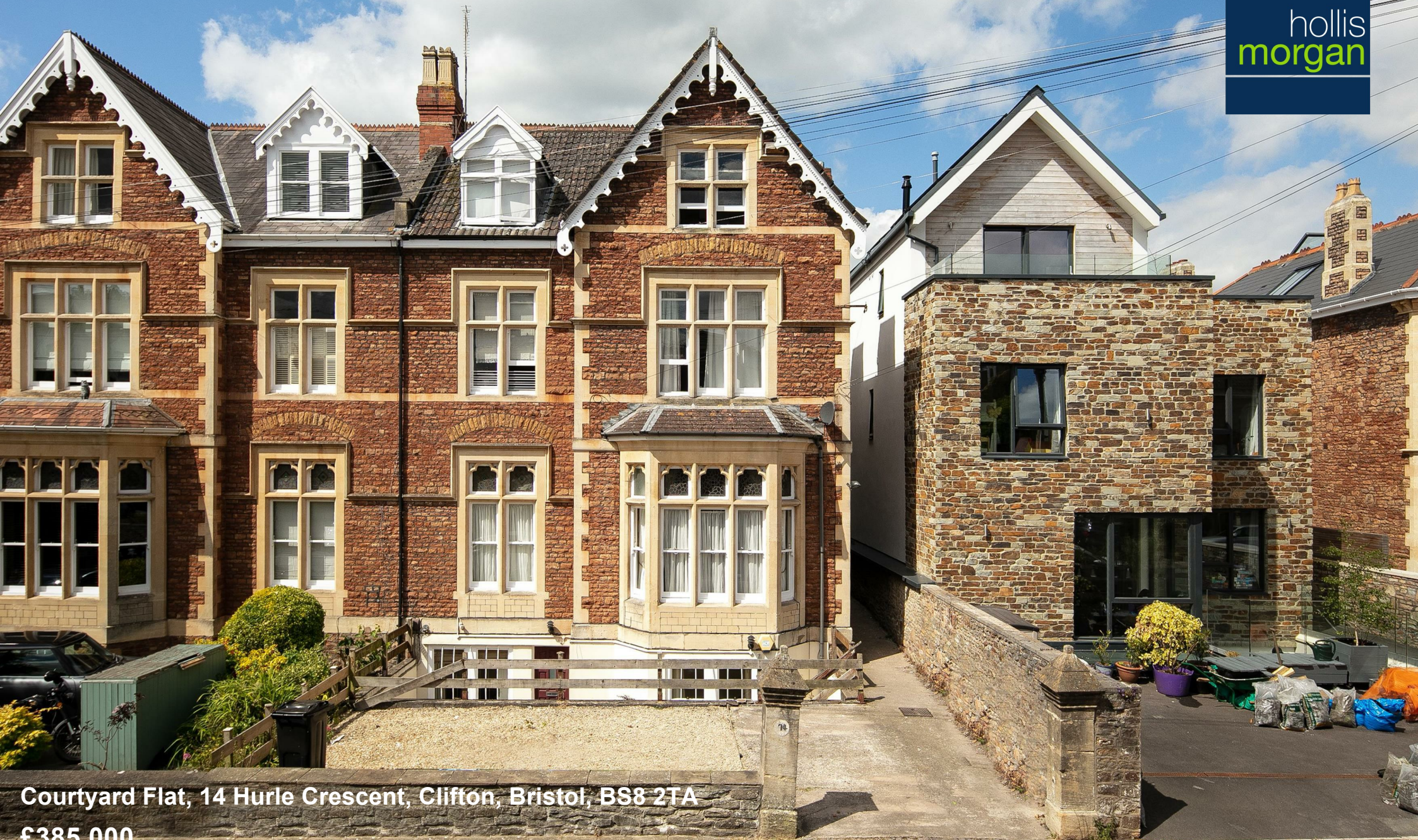
Courtyard Flat, 14 Hurle Crescent, Clifton, Bristol, BS8 2TA